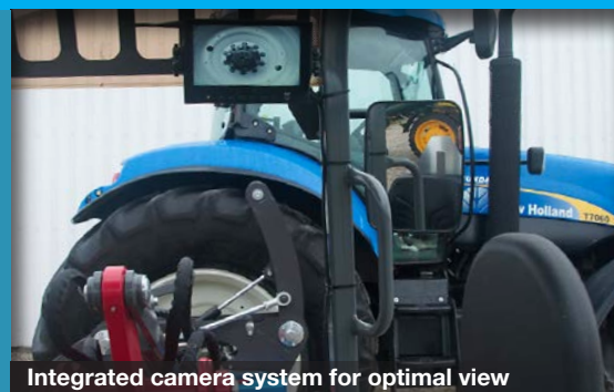
Integrated camera system for optimal view

Can be customized with quick shift option depending on carrier.