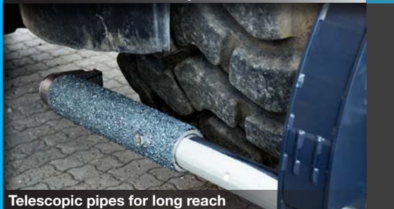
Telescopic pipes for long reach