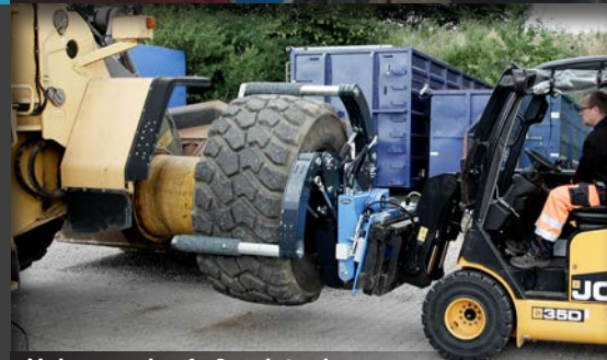
Unique and safe 3-point grip