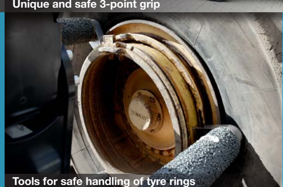
Tools for safe handling of tyre rings

Special designed Ring Handling Tools for handling multi-piece rim wheels. With the Ring Handling Tools the tyre technicians can grip, hold, press, or place tyres, rims and rings as needed - a major improvement of safety and efficiency!