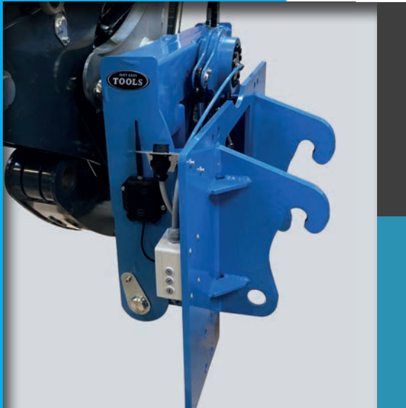
Customized attachment system