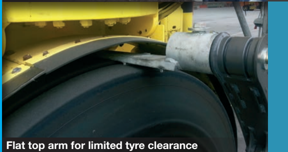
Flat top arm for limited tyre clearance